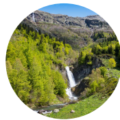
Saut deth Pish