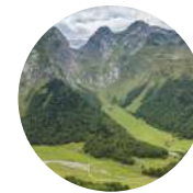
Artiga de Lin